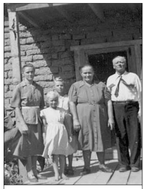
A typical Mexican adobe house

Families were large and soon land became inadequate. Irrigation was