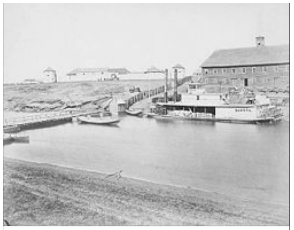
Riverboat "International" docked at Fort Garry bringing Mennonite immigrants from the USA

Many of the earlier German colonists in Russia had accommodated themselves to conditions in Russia to a greater extent than the more recent-