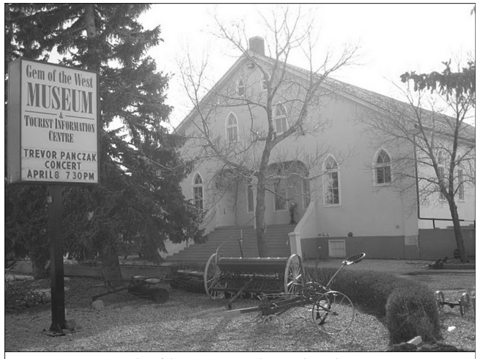
Site of the MHSA Annual General Meeting, Coaldale, Alberta - April 9, 2011

nal Sunday School rooms, now used as a workshop, store display, and butcher shop. This transformation has been possible because of donations received from across Canada, usually from former members, volunteers, professional help when needed, and grants. They are amazed at the trust and confidence they have received from the Alberta government and local societies. Of the many grant requests sent, 24 were approved for a total of approximately $450,000.