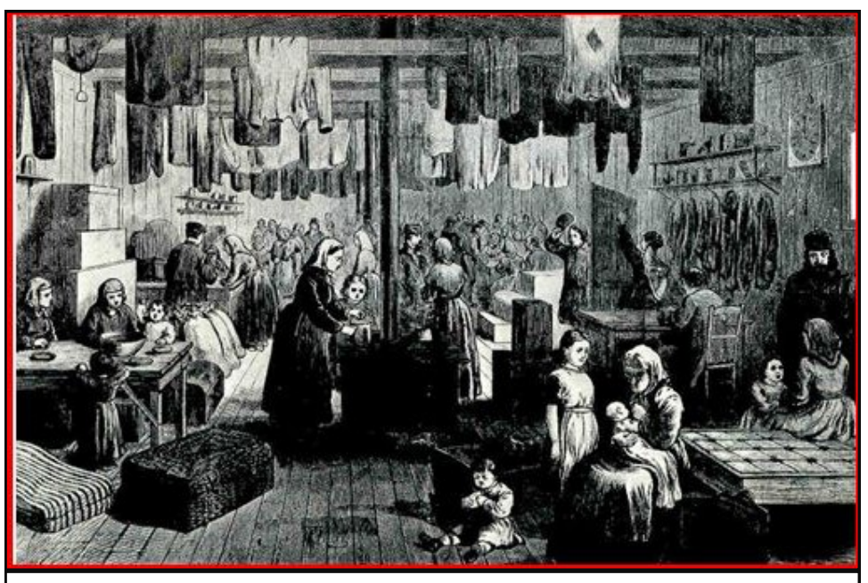
Life in a Mennonite Immigration Shed

The specific issues of greatest concern to Mennonites in Russia in the 1870s were conscription for military or alternate wartime state service and government interference in Mennonite elementary schools. The issues, from the Mennonite point of view, were simple. The government was withdrawing special privileges they had been promised when coming to Russia. While most did not understand the reasons for the Russian government's action, they believed that the foundation of their churches and communities had shifted. Some looked for ways to repair the damage; others opted to sell and rebuild on what they hoped would be a firmer foundation.