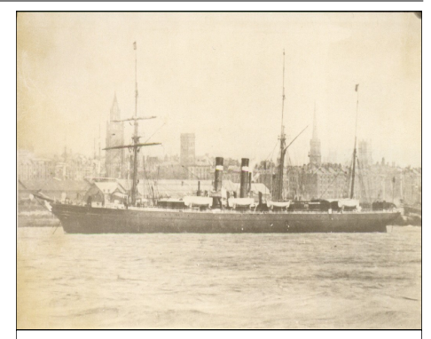
SS. Peruvian

ly arrived Mennonites. Several issues were also much more important to the Mennonites than to other settlers. Most notably, the original exemptions from military service had been granted because the incoming settlers did not want to be compelled to fight against their German kinfolk in any war between Russia and Prussia or Austria. For the Mennonites refusal to render military service was primarily a religious matter; rooted in their Anabaptist theology and heritage.