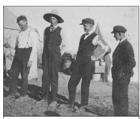
A group of Mennonite men setting up camp upon arrival in Mexico

The Mennonite colonies in Mexico had about 12 - 20 villages each.